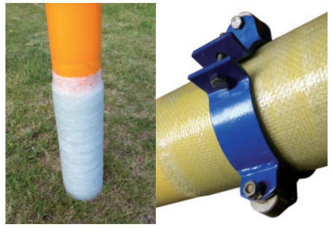
Ground to air protection

Excellent resistance against chemicals (resistance table on request)