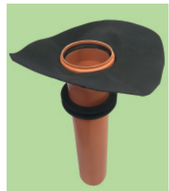
Baseplate pipe penetration incl. glue-on flange