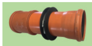
Wall pipe penetration with bell on both side