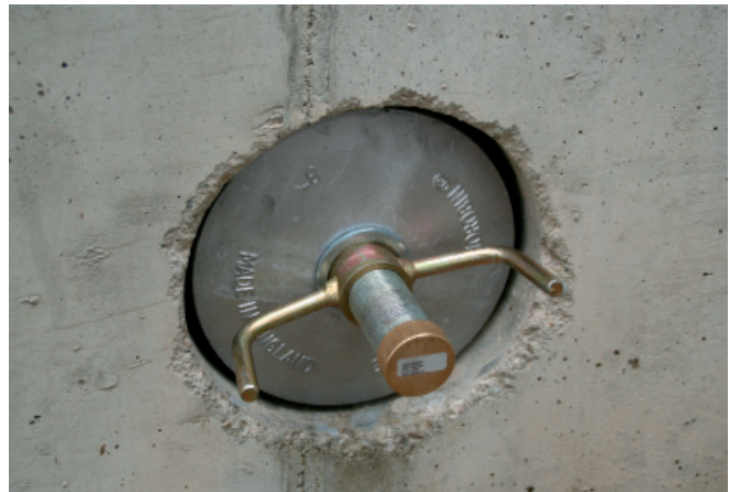
Aqua Stopper closes core drilled hole