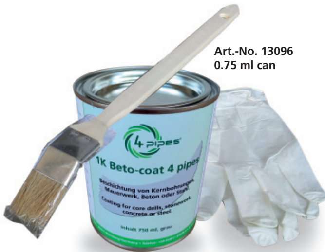
Art.-No. 13096 0.75 ml can